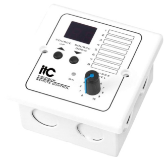
T-8000C (Grey & Aluminum)