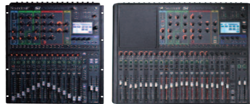
Available in 16 channel (19"), 24 and 32 channel versions

And a new security mode prevents unauthorised access to key functions. In addition to 'total lockdown', security can be tailored for different 'operator access' levels – for example locking out house EQ and processing for guest engineers whilst, allowing access for in-house operators.